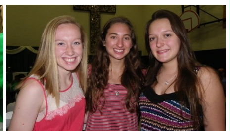
Alums return to wish a fond farewell to the Class of 2016